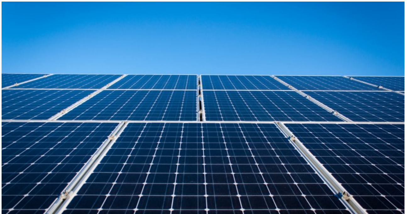
Solar pannel

Pre-study of photovoltaic installation, budget and feasibility for the City Council