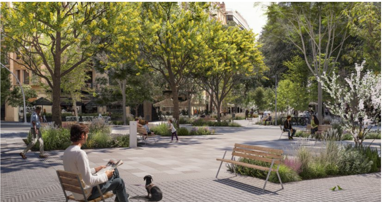
Render of the green axis projected on Rocafort street © Ajuntament de Barcelona