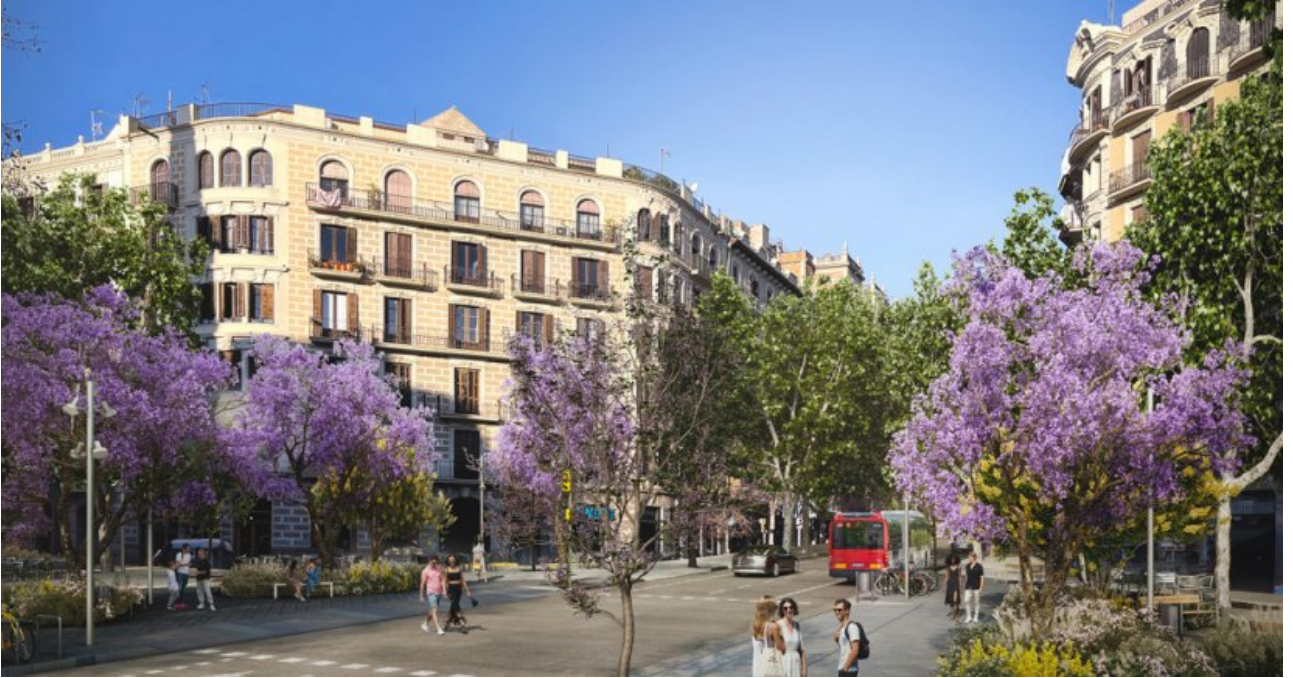
Render of the green axis projected on Consell de Cent street © Ajuntament de Barcelona